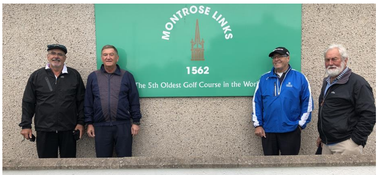
Four happy golfers about to take on 1562.