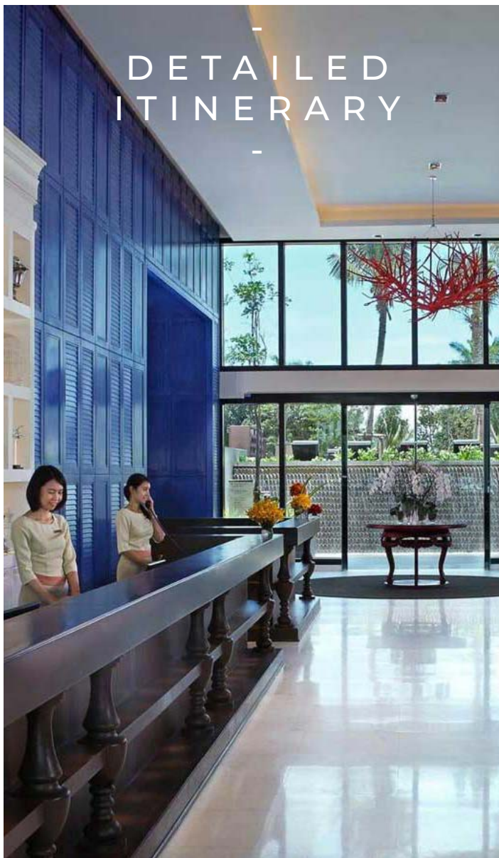
AMARI HUA HIN HOTEL