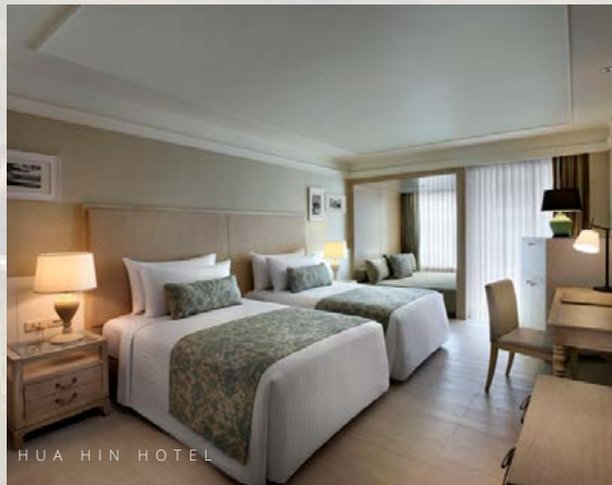
Golfer Sharing Accommodation R24 900 pp