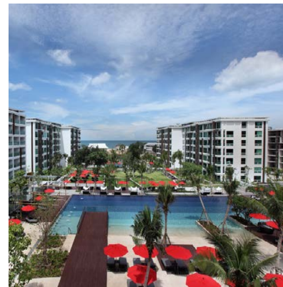
AMARI HUA HIN HOTEL

After checking into the hotel, those wanting to get some rest may do so while others can dive straight into the Thailand nightlife by taking a walk on the streets and seeing what Hua Hin has to offer.