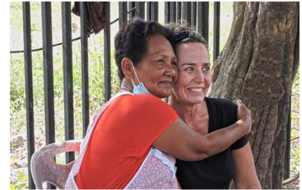
EAT LIKE A LOCAL FOOD TOUR

Spend your last evening at leisure before meeting in the hotel lobby for the late transfer back to Bangkok airport (+- 9pm).