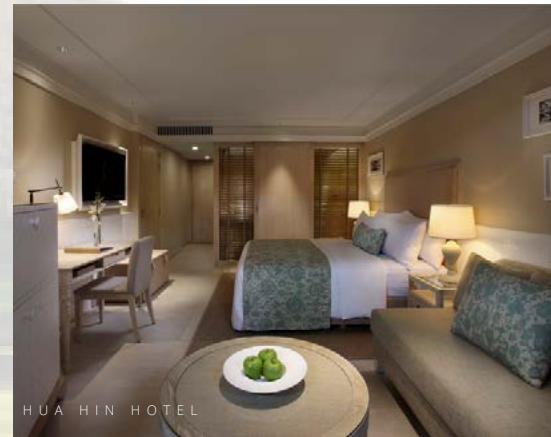
Non Golfer Sharing Accommodation – R19 500 pp