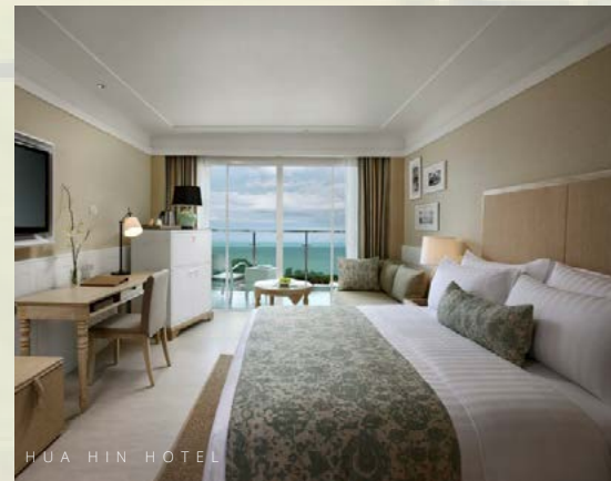
Non Golfer Single Accommodation – R24 500 pp