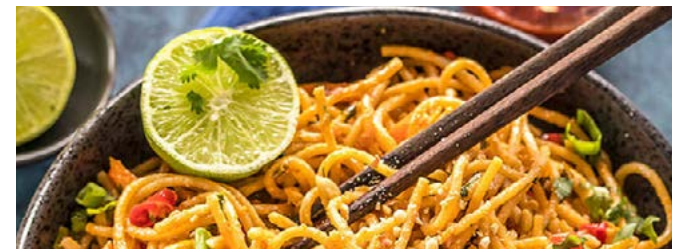
POT THAI PEANUT NOODLES

After breakfast we will meet in the hotel lobby and depart on our very exciting Eat Like a Local Food Tour. On this 3½ hour tour, your guide will take you off the beaten track. You will try some amazing tasting Thai food in humble surrounds. You will be eating with locals, which just backs up the age-old adage that 'locals always know where to find the best food in town'. The tour comprises of around 15 food tastings stopping at 5 restaurants & 1 street food vendor. Slurp and eat noodles within a traditional 2 storey Thai house near the railway line. Sample Thai sweets that will challenge and delight your senses. Sample the subtle flavours of Northern Thai cuisine. After the tour, perhaps spend some time on the beach soaking up the sun, come on you deserve it! There are loads of markets keeping you entertained or chill out having a cocktail at the hotel swimming pool, the choice is yours.