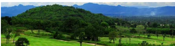
BANYAN GOLF CLUB

Golf at Banyan Golf Club (2009 Best New Course in Asia: scenic & well-maintained) including cart and caddie