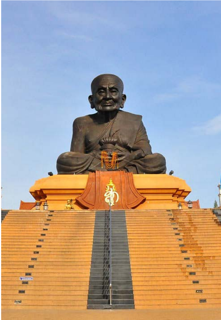
WAT HUAY MONGKOL