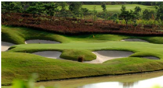
BLACK MOUNTAIN GOLF COURSE