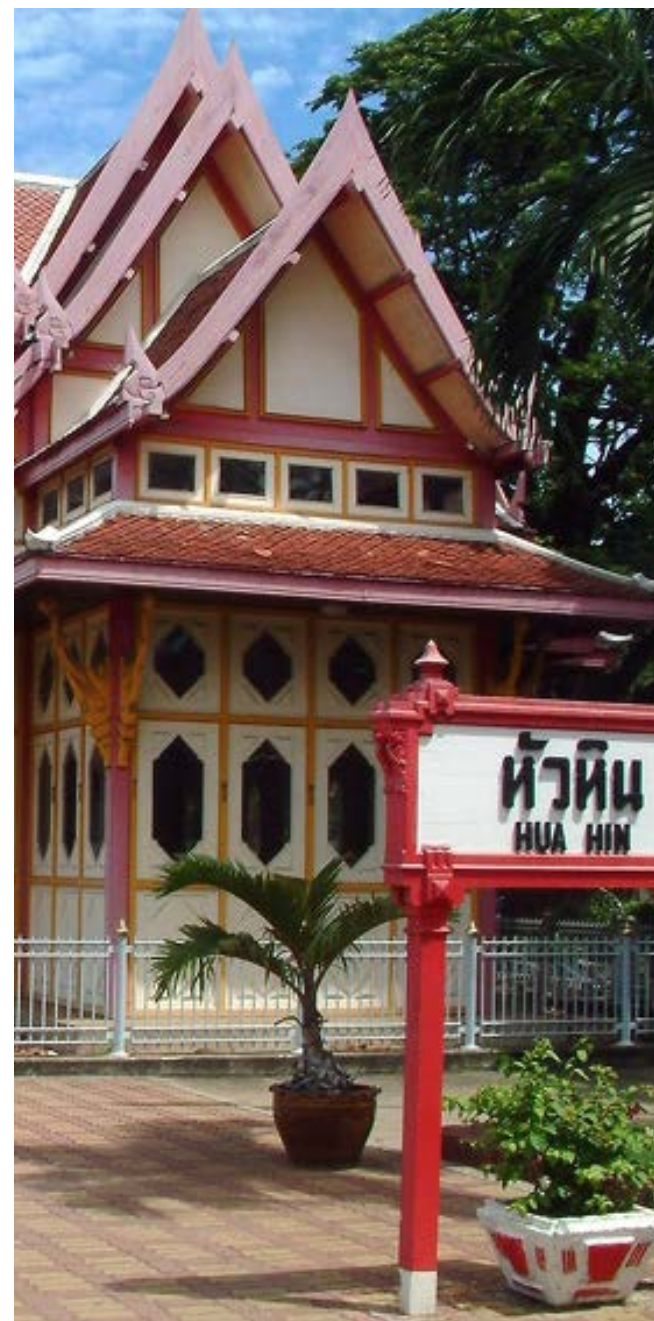
HUA HIN RAILWAY STATION