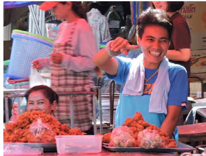
EAT LIKE A LOCAL FOOD TOUR