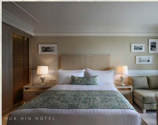
Golfer Single Accommodation – R29 900 pp