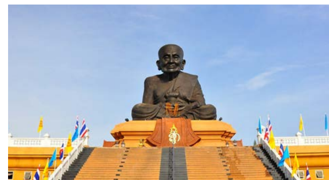
WAT HUAY MONGKOL