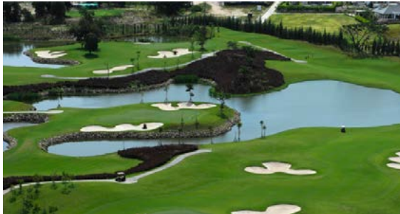
BLACK MOUNTAIN GOLF COURSE