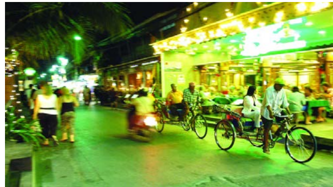
HUA HIN NIGHT LIFE

After golf, take your time walking the streets of Hua Hin, visit the Cicada Night market, grab a bite to eat and take in the Thai nightlife.